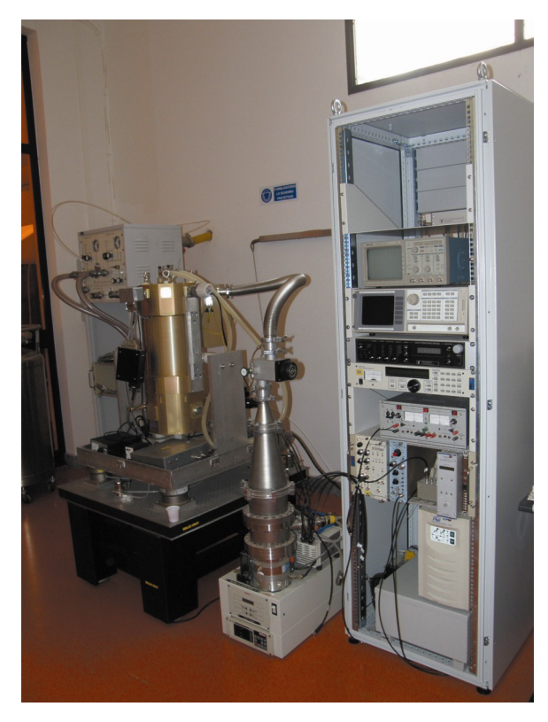
Fig. 2. The cryostat used for developing low temperature detectors.

Similar in nature to light, x-ray also show "colours". They differ in the same physical features that allow, for instance, the distinction between red and violet light. And in keeping the analogy with visible light, soft X-rays correspond to the red colour, hard X-rays to the violet.